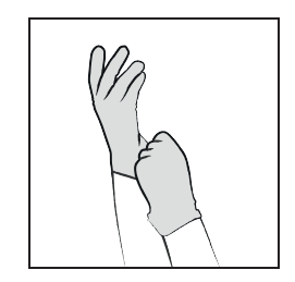
2. Put on disposable hand gloves to decrease the risk of exposure