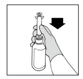
5. Push the tip of the dosing syringe into the hole in the adaptor. Your doctor or pharmacist will advise you of the correct syringe to use, either the 3 ml (small) syringe or the 10ml (large) syringe in order to give the correct dose