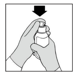
Push the adaptor firmly into the top of the bottle and leave in place for future doses