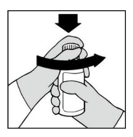
Remove the bottle cap