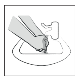
Wash your hands before and after administering a dose. Wipe up spillages immediately