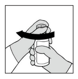
Put the cap back on the bottle with the adaptor left in place. Ensure that the cap is tightly closed