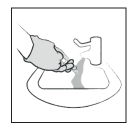
13. Wash the syringe with cold or warm tap water and rinse well. Hold the syringe under water and move the plunger up and down several times to make sure the inside of the syringe is clean. Let the syringe dry completely before you use it again