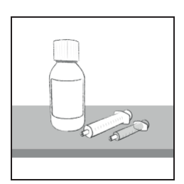
14. Store the medicine in a refrigerator (2 °C – 8 °C). Store the syringe(s) in a hygienic place

Wash immediately and thoroughly with soap and water if Hydroxycarbamide comes into contact with skin, eyes or nose